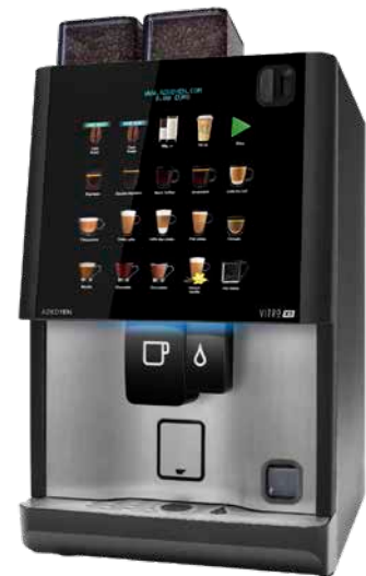
EXE/MDB change giver integration option