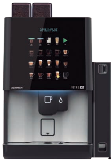
External EXE/MDB payment module