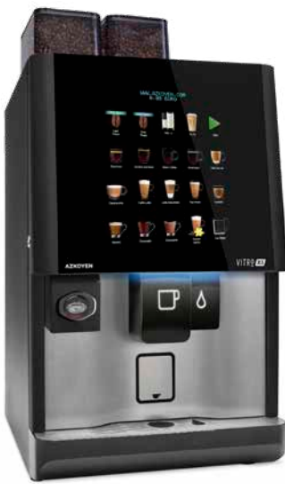
Cashless system integration option

The machine is compatible with Pay4Vend App, allowing payment directly from a mobile phone.